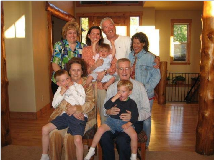
Penny and California Relatives